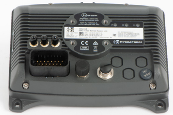
ERAU-6200 Remote Access Unit