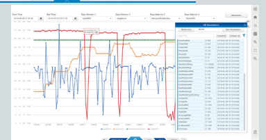
The wireless control system monitors air and oil pressure, oil flow, probe distance and angle, and more parameters.