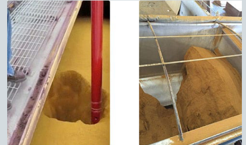
The operator uses remote controlled hydraulics to drive the probe down and loosen hardened meal in a hopper railcar (left) or truck trailer (right).