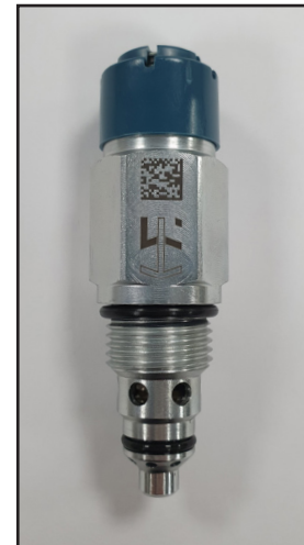
RVD58-20 with blue cap (Factory Set by HydraForce)