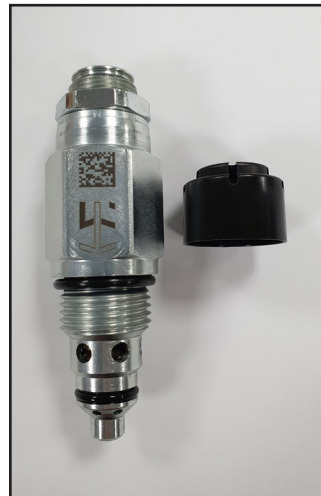
RVD58-20 with black cap (pressure to be set by distributor)

If you have questions, please contact your HydraForce representative.